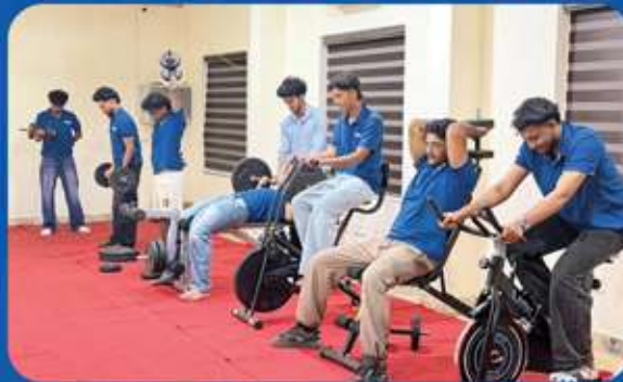
ITM GYM- Powering your potential