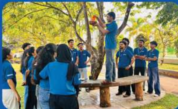
For a bird, a drop of water is a drop of hope