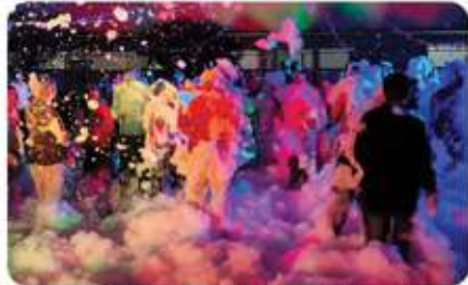
CHRISTMAS DAY CELEBRATION