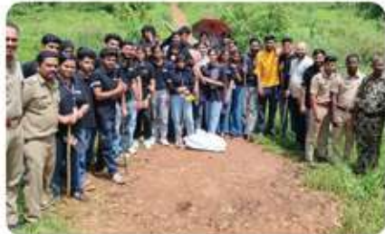
WORLD ENVIRONMENT DAY CLEAN UP & TREE PLANTATION DRIVE PITHALMALA