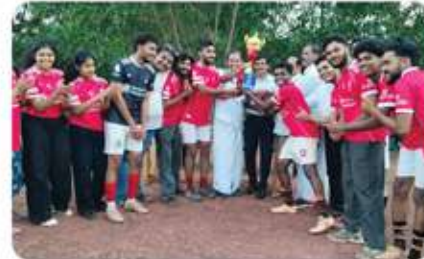
ITM PREMIER LEAGUE CHAMPIONS