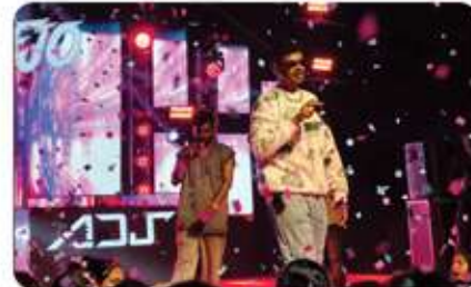
FEJO LIVE CONCERT