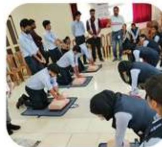
BASIC LIFE SAVING SKILL

By engaging in service-oriented initiatives, students learn empathy, ethical leadership, and sustainable thinking – reinforcing the belief that successful managers must also be responsible citizens.