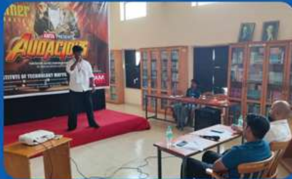
National Level Management fest Audacious 2k26

This club is born with a vision to make the college campus green and Eco-Friendly and educate the students about the importance of sustainable development. Outside of the campus also.