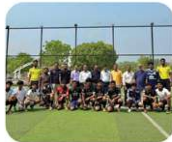
INTER COLLEGE FOOTBALL TOURNAMENT

Cultural activities are the best means to reflect the values and beliefs of a community. ITM MBA Arts Club is a cultural platform for the students.