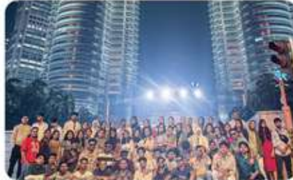
MALAYSIA FREE INTERNATIONAL INDUSTRIAL VISIT