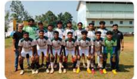
COLLEGE FOOTBALL TEAM