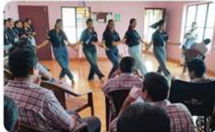
CHILDREN'S DAY CELEBRATION AT SNEHATHEERANM BUDS SCHOOL