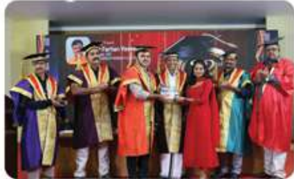
HONORING THE KANNUR UNIVERSITY TOPPER

Here learning is blended with fun where a number of extra-curricular activities starting from sports to cultural events are being celebrated. Students are inspired to participate in these activities in line with their interests. These events are managed by the students themselves giving them the chance to possess active expertise in handling such events.