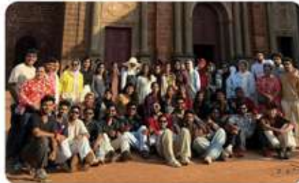
LEISURE TRIP AT GOA